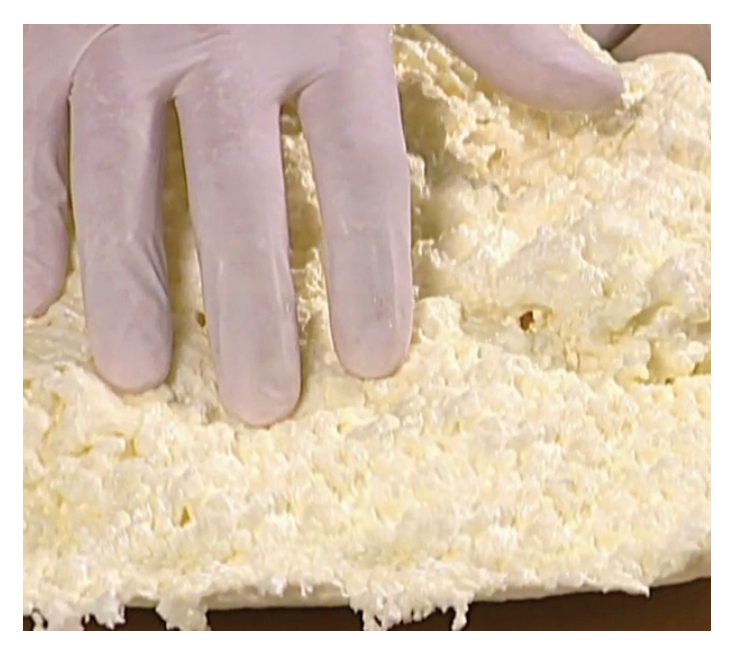
B-component rich mixture